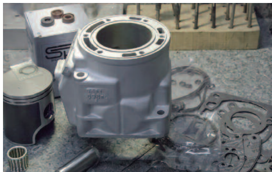
FAST ENTERPRISES ALSO HAS READY-TO-SHIP CYLINDERS KITS, COMPLETE WITH PISTONS, WRISTPIN AND ALL THE NECESSARY SEALS AND GASKETS TO GET YOU BACK ON THE TRAIL FAST.